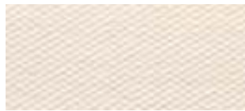
Pastel primer applied on canvas