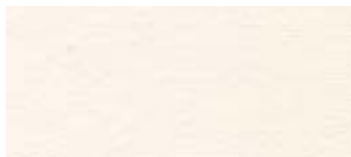
Pastel primer applied on a painting board